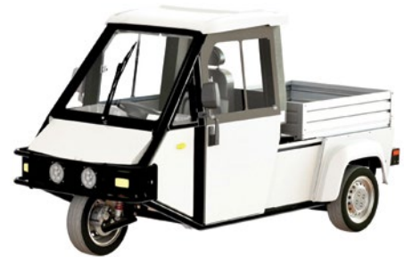
GO-4 EV - 3-wheels - New model for 2025