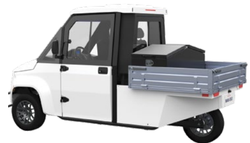
MAX-EV3 - 3-wheel tadpole design