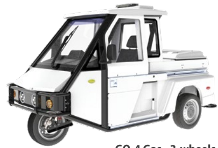
GO-4 Gas - 3-wheels

A tadpole design with two wheels up front and one in the rear. Greater stability at speed, twin passenger, 13 foot turning radius.