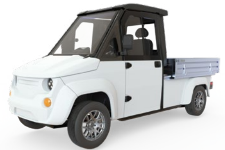
MAX-EV 4-wheel LSV