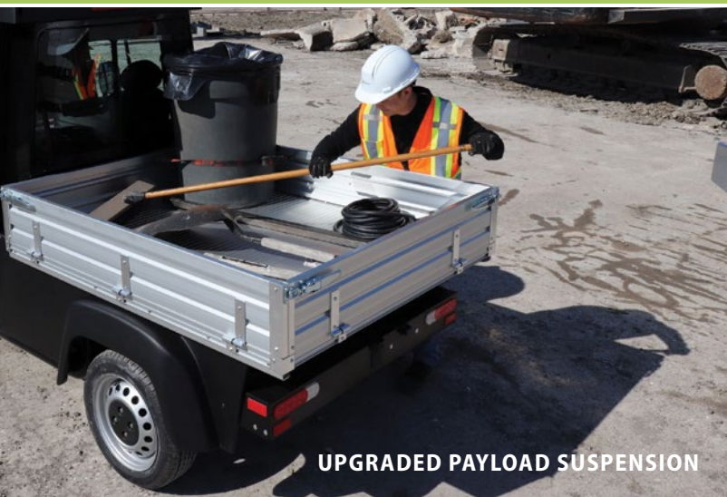
UPGRADED PAYLOAD SUSPENSION