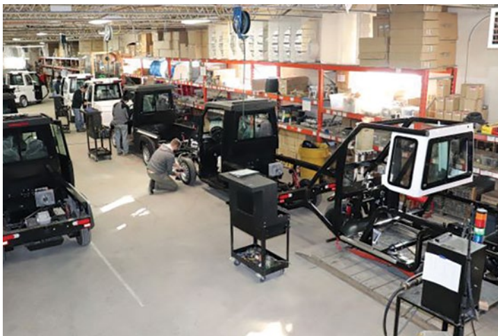
BUILDING LITHIUM-ION EVS SINCE 2014

**Total payload includes allocation for operators and will vary depending on accessories added. MAX 15-20 have reduced payloads due to max GVWR LSV class of 3000lbs. Payloads are based on a base vehicle with no options, available off-road upgrades. The MAX-EV 6Kw is an entry level commuter and not recommended for severe heavy payload usage.