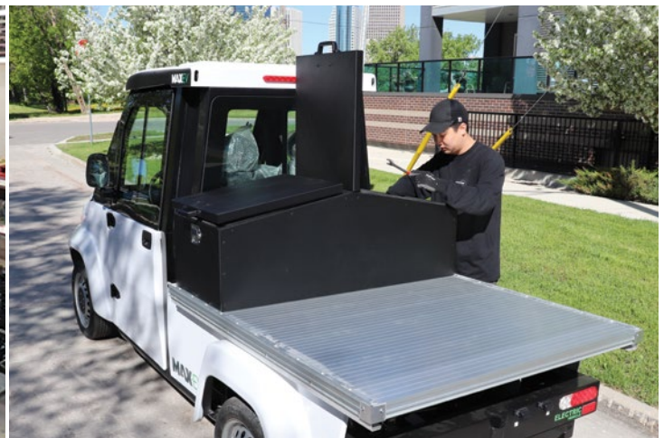
WHITE MAX-EV 15KW WITH GULL-WING INDUSTRIAL TOOL BOX