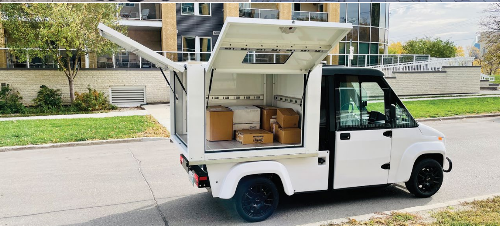
MULTIPLE VAN BODY CONFIGURATIONS AVAILABLE