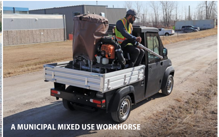
A MUNICIPAL MIXED USE WORKHORSE