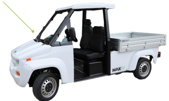
MAX-EV ORV base model with roof and windshield, deck walls and standard radials