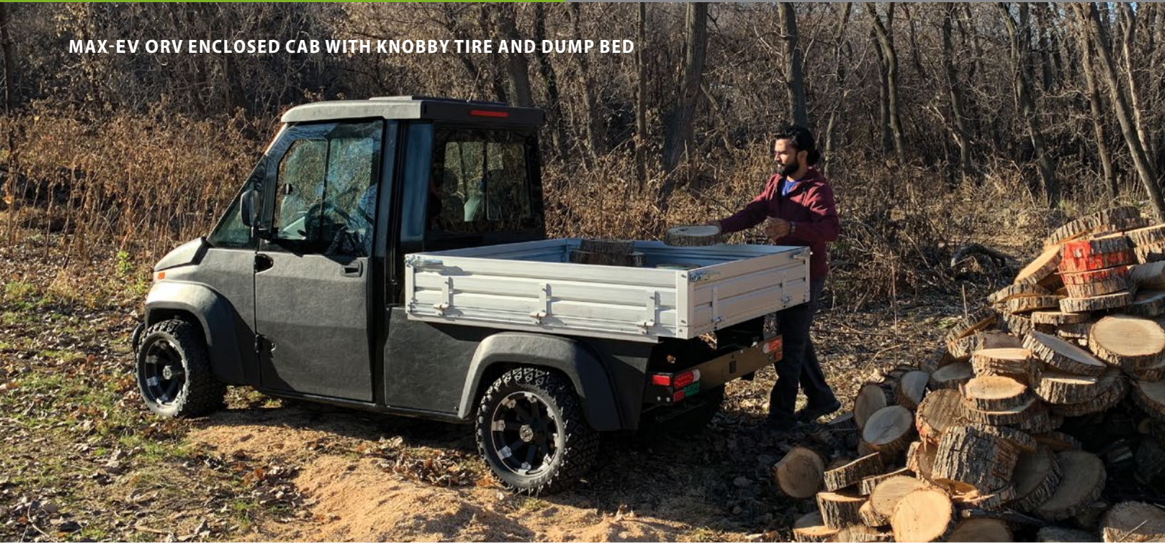
MAX-EV ORV ENCLOSED CAB WITH KNOBBY TIRE AND DUMP BED

An ORV is an off-road vehicle designed for travel on unpaved terrain. Standard on-road options such as DOT turning signals become optional on an ORV, unlike the LSV, it is not classified for on-road use. Add wide fender flairs to accommodate larger turf or knobby tires, ideal for turf, loose soil, or snow. Option our dual motor 4WD for increased traction with minimal range loss.