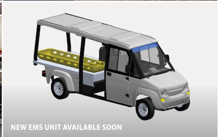
NEW EMS UNIT AVAILABLE SOON