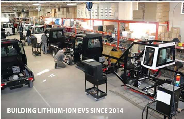
BUILDING LITHIUM-ION EVS SINCE 2014