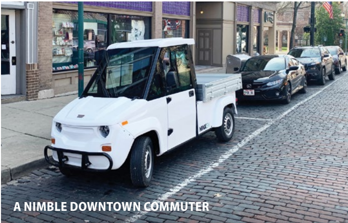
A NIMBLE DOWNTOWN COMMUTER

Please inquire for more detail. On-road LSV's are regulated by a 3000lb weight class. Typical MAX total payloads range from 1000 to 1500lbs.