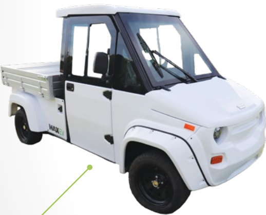
MAX-EV ORV enclosed cab with wide fender kit and low profile turf tire